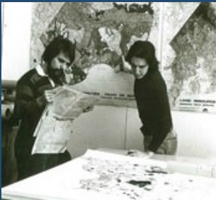
At the Harvard GSD, 1973