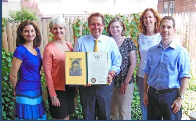
At TCA's West Chester Office, 2013

highlighted TCA's work in West Chester Borough and Media Borough, as well as the New Daleville and Pine Hall TNDs.