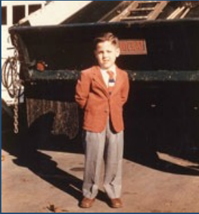
At E. Santoleri & Sons, 1955