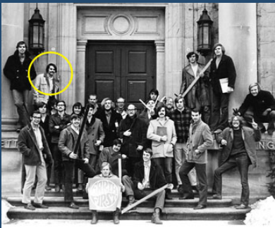
At Penn State, 1970