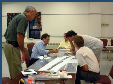
At Media Borough, 2007