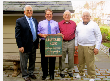
With Santoleri Brothers, 2011