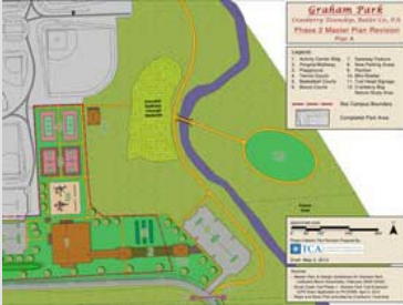
Graham Park- Phase 2 Master Plan Recommendations.

The 8th Annual Symposium was held March 30, 2012.