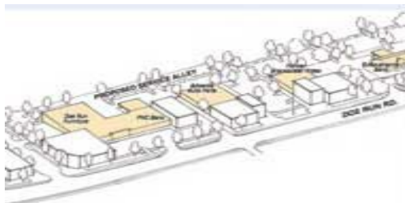
Proposed streetscape enhancements and infill development along Doe Run Road Penn Township - Lancaster County, PA

In March 2012, TCA received the 'Envision' Leadership Award from the Lancaster County Planning Commission . Working closely with key community stakeholders throughout 2009-2010, TCA re-vamped Penn Township's Ordinances to address many Form-based Code elements, including: mixed land uses, compact building arrangement, pedestrian and vehicular connectivity, sustainable green infrastructure, heritage farmland protection, meaningful public spaces, and walkable neighborhoods, consistent with the Penn Township Comprehensive Plan, part of the Manheim Central Region Comprehensive Plan.