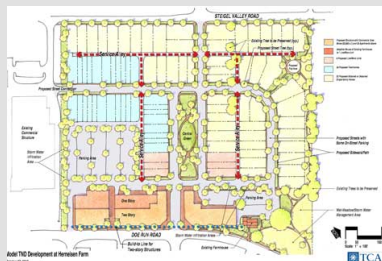
Model TND Plan, in Zoning Ordinance