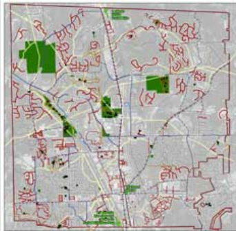
Cranberry Township emerging Recreation & Open Space Plan