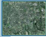
Urban Park, Recreation and Open Space Plan for the City of Lancaster Pennsylvania - July 31, 2008

Earlier this year, the PA/DE Chapter of the ASLA recognized TCA for excellence in Analysis and Planning for its Urban Parks, Recreation, and Open Space Plan created for the City of Lancaster. The Award is featured in the current issue of PLAN .